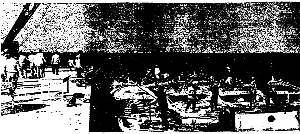
Wooden lighters crowd against the new finger pier in Gaza Port to unload their cement.